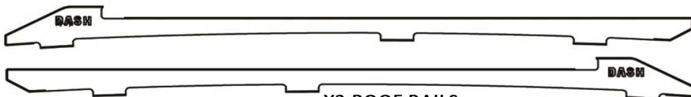
X2 ROOF RAILS