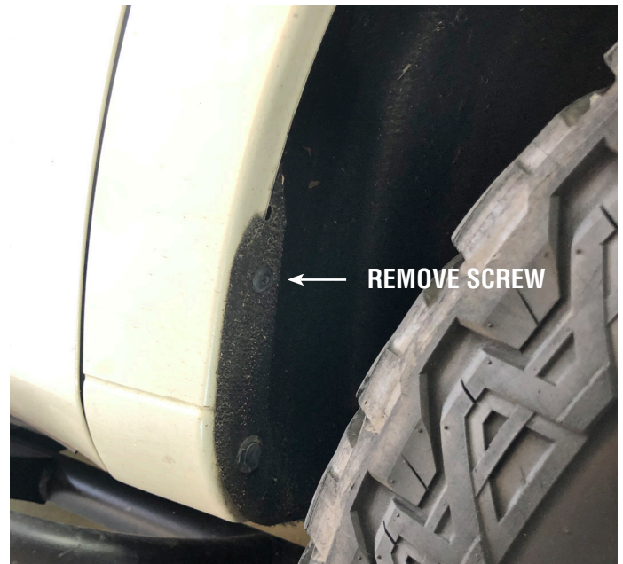
REAR WHEEL ARCH