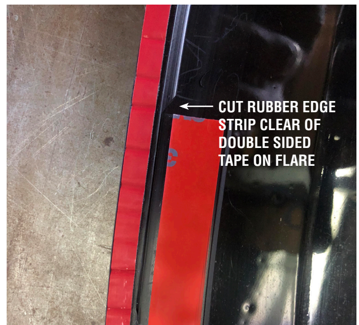
UNDER SIDE OF FLARE