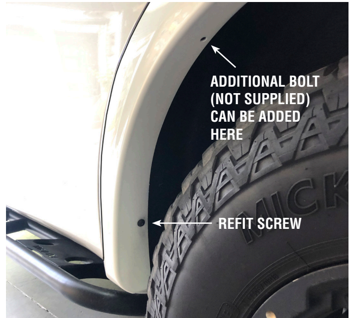
BACK WHEEL FLARE

17. Once the Sikaflex is dry (check drying times on Sikaflex tube) you can remove the tape.