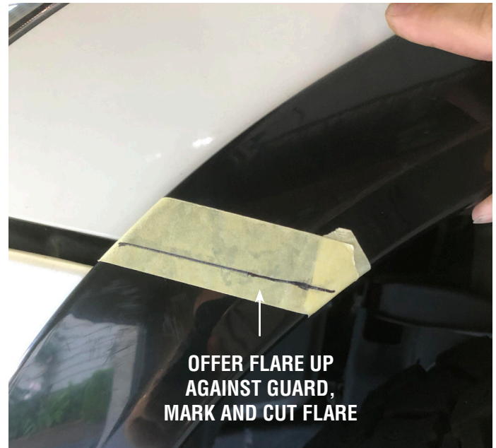
FRONT FLARE AGAINST BULL BAR