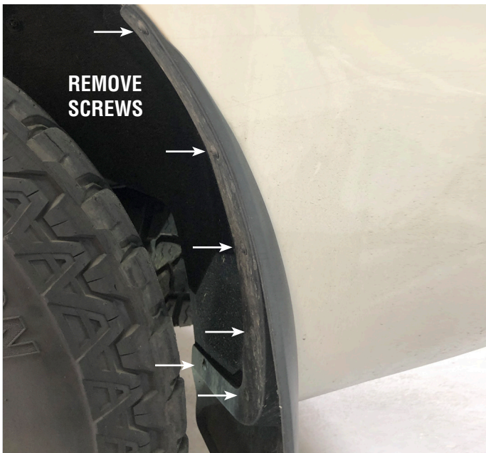
REAR MUD FLAP