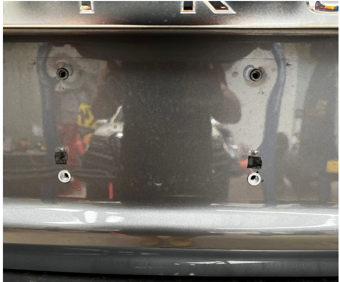
IF YOU DO NOT HAVE A RIVET GUN THESE CAN BE INSERTED MANUALLY - SEE 'DASH OFFROAD BASH PLATE INSTALL" ON YOU TUBE FOR MORE DETAILED INSTRUCTIONS ON THIS PROCESS

6. Remove the number plate bolts, lift the base plate out of the way and drill and insert the 2 M8 Nutserts (It is recommended to paint the holes before inserting the nutserts)